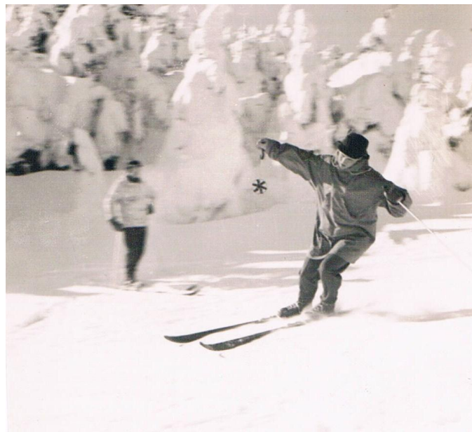
Dad Skiing in Vermont

You can make the sauce in advance. Cool to room temperature, cover and store in the refrigerator. When you're ready to continue, bring the sauce to a simmer and complete the recipe.